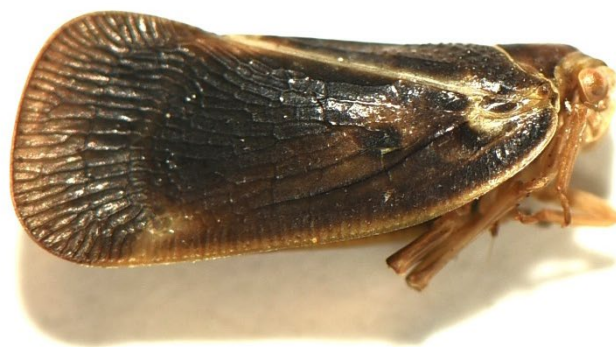
Figure 2 – Adult M. pruinosa

The earliest recorded instance of M. pruinosa occurring outside its natural range dates back to the late 1970s, when the species was first documented in northern Italy [18]. Subsequently, it established itself in Sicily and mainland Italy and began to actively expand its range across European countries [3; 8]. Some studies confirm that