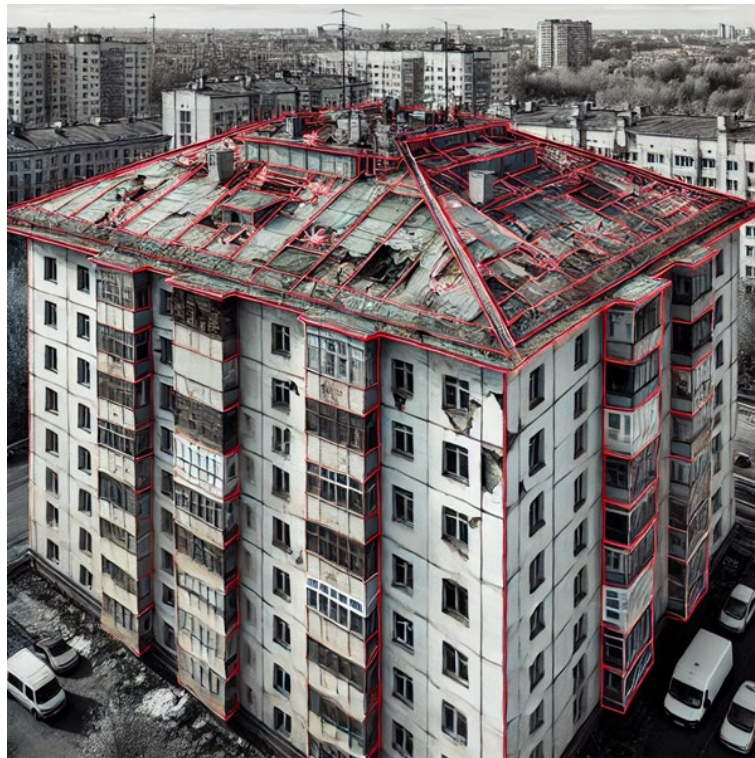
Figure 3 - Drone LiDAR Point Cloud Visualization

Expedited survey timelines further improve project efficiency by reducing the logistical complexities associated with multi-person teams and heavy equipment. Cost savings in labor, transportation, and materials further strengthen the argument for transitioning to aerial inspection methods. Drones also foster standardized data collection practices, thereby facilitating longitudinal studies that track incremental changes in a building's structural health. This advantage extends to other indoor scenarios, where specialized sensors can detect floor unevenness or minute damage under raised floors, mitigating disruptions and ensuring smoother commercial or industrial operations [7].