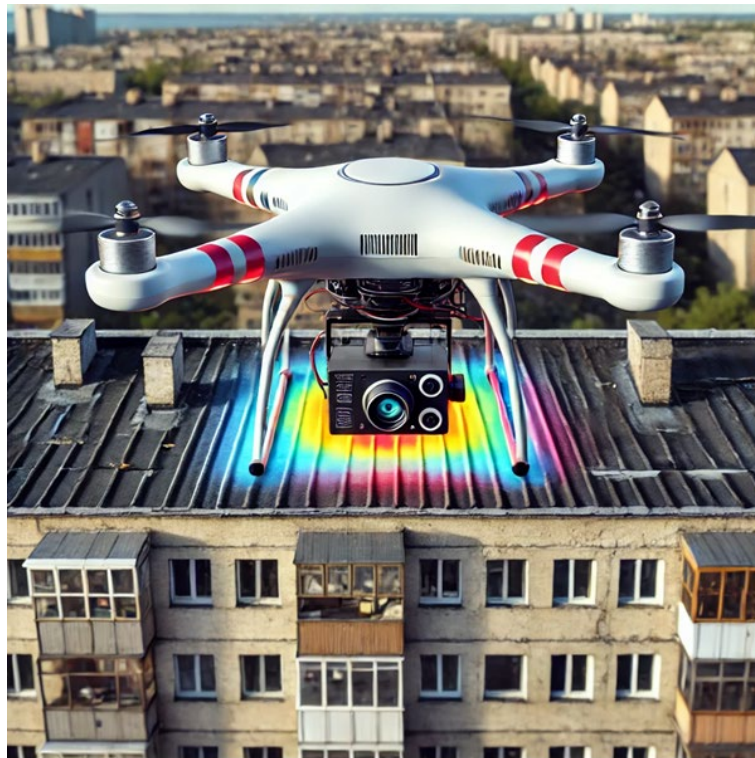
Figure 1 - Drone-Based Roof Inspection Setup

Technological Advancements in Roof Inspection. In parallel, drones have rapidly emerged as an essential tool for roof inspections (figure 1), providing notably higher levels of efficiency, accuracy, and safety compared to manual, on-site methods.