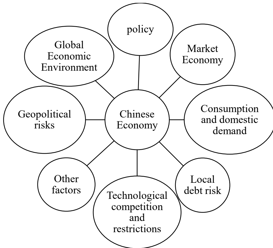
Figure 1.1 Main factors affecting China's economic stability.